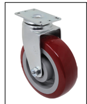
6" POLYURETHANE CASTER, SWIVEL

Heavy-duty hauling made easy. This truck is built to move it all.