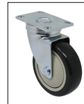
4" POLYURETHANE CASTER, SWIVEL